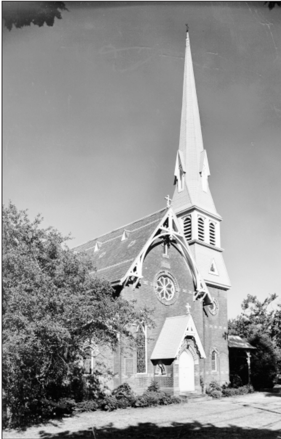
HISTORIC LEGACY... In 1997, the Scotch Plains Baptist Church on Park Avenue celebrated the 250th anniversary of the founding of its congregation. Throughout its long history, from Colonialism to the computer age, the church has represented a strong faith community in the township. The adjacent cemetery, originally known as "God's Little Acre," is the final resting place of many original settlers in the area and 24 soldiers who served in the Revolutionary War. The church held a series of special events last year to commemorate its milestone.