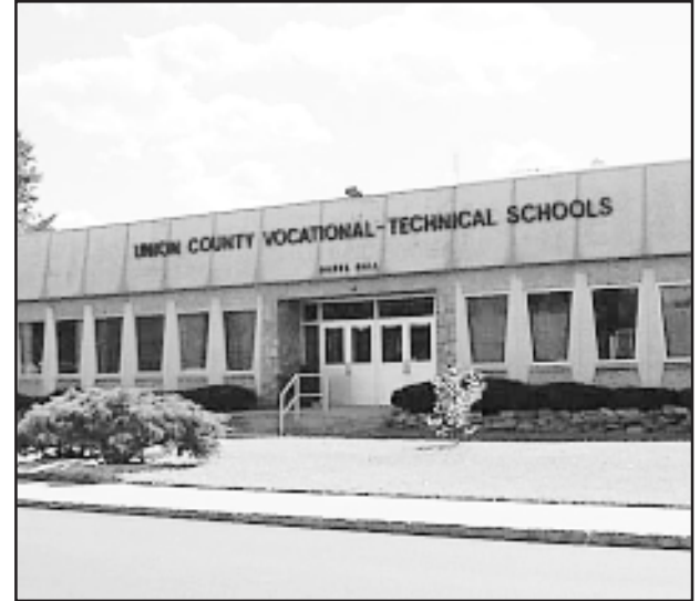
Union County Vocational-Technical Schools