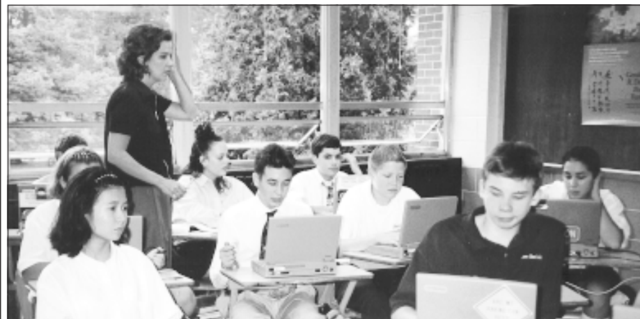
Leader in State of the Art Technology

1600 Martine Avenue Scotch Plains, NJ 07076 For information call (908) 889-1600