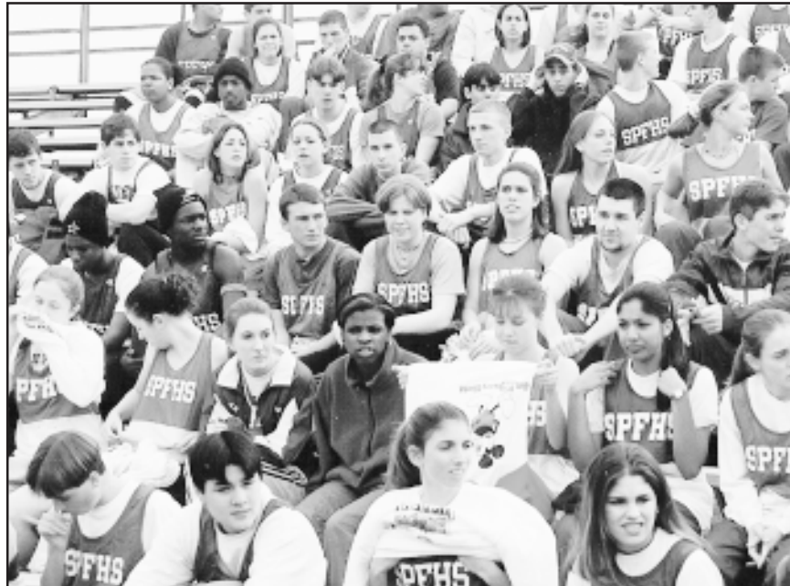
The Raider Girls and Boys Track Team