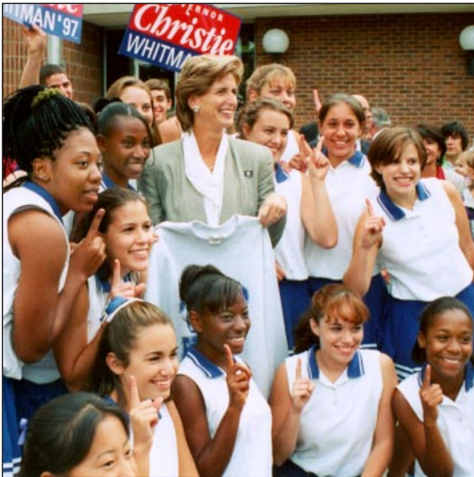
WARM WELCOME... Scotch Plains-Fanwood High School cheerleaders surround Governor Christine Todd Whitman in front of the Scotch Plains Municipal Building during her visit to the township as part of her second gubernatorial campaign in September of 1997. The governor received a "Raiders" sweatshirt as a souvenir.