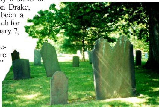
"GOD'S LITTLE ACRE"...Graves in the cemetery adjacent to the Scotch Plains Baptist Church are inscribed with the names of some of the area's oldest families.

The pastors who lived at the parsonage subsisted off whatever they could grow on 15 acres of the parsonage farm in addition to a small salary and firewood. In 1868, the church trustees sold off the parsonage farm in order to pay for the new church.