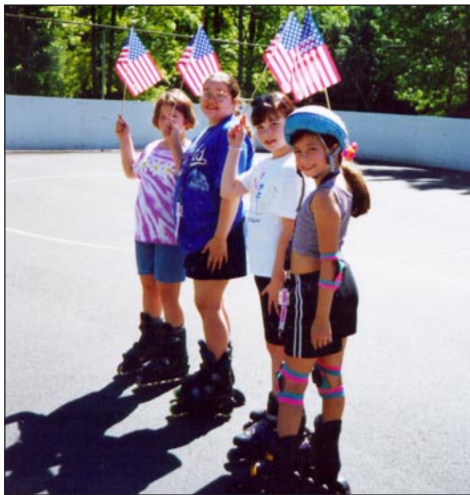
ALL-AMERICAN... Youngsters enthusiastically wave their flags while rollerblading during July 4 festivities at Brookside Park in Scotch Plains last year. The park is one of several around the township which offer a variety of recreational activities.