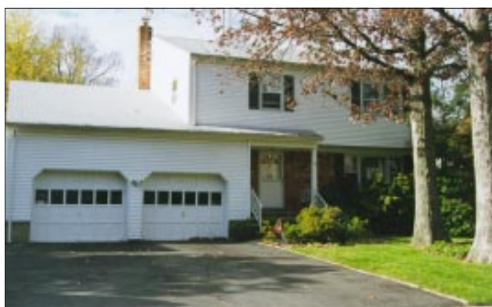
CRANFORD $450,000 Exceptional Colonial on large lot. Four Bedrooms, 2 full Baths plus a half Bath, Family Room, large Eat-in Kitchen and more. WSF-8477

Distinctive Offerings presented by the Westfield Office