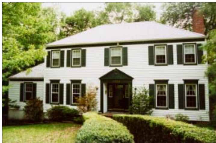
MOUNTAINSIDE $449,900 Colonial on quiet street. Eight rooms, 4 Bedrooms, 2 1/2 Baths, updated Rec Room and Office in basement and more. WSF-8324