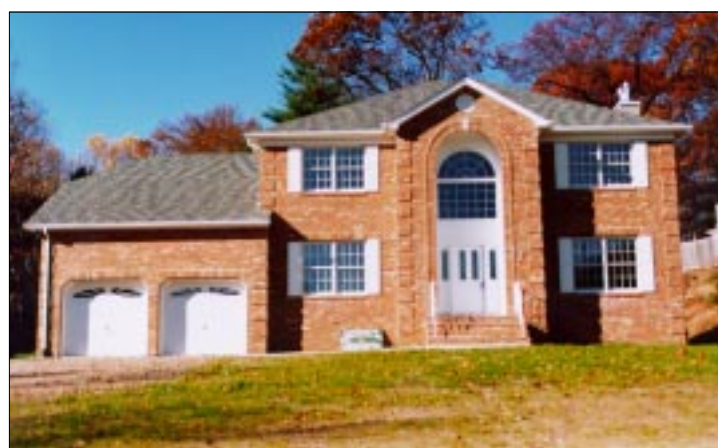
MOUNTAINSIDE $499,900 Beautiful brickfront Colonial newly constructed, Large Living Room, Formal Dining Room, and Family Room with fireplace. WSF-8256