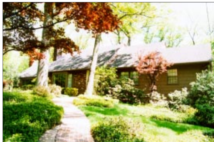
WESTFIELD $665,000 If the environment matters... you'll treasure the setting and enjoy this home. Its loaded with amenities, views. WSF-8107