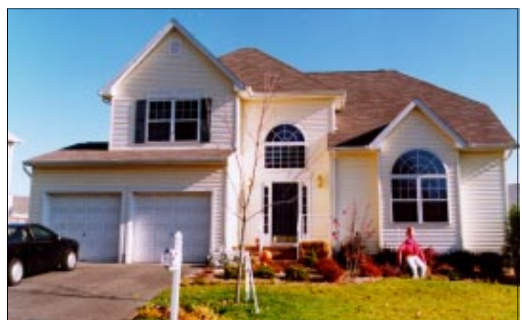
SCOTCH PLAINS $425,000 Too good to be true. Designed for easy living center hall Colonial. Two years old. Four Bedrooms. Light, bright, lovely. WSF-8465