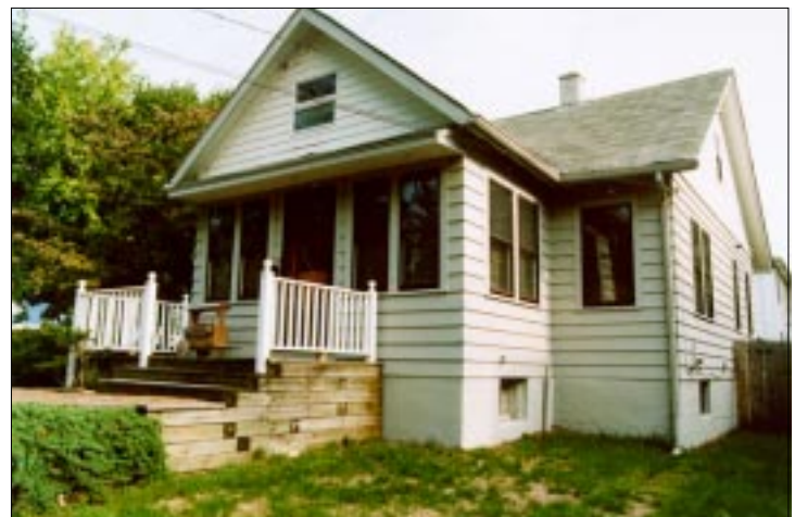
WESTFIELD $259,900 Seven room Colonial or 5 rooms with separate entry to quarters for live-in. Finished basement, 2 car garage. WSF-8380

Come Browse Our Web Site! www.nymetro.coldwellbanker.com