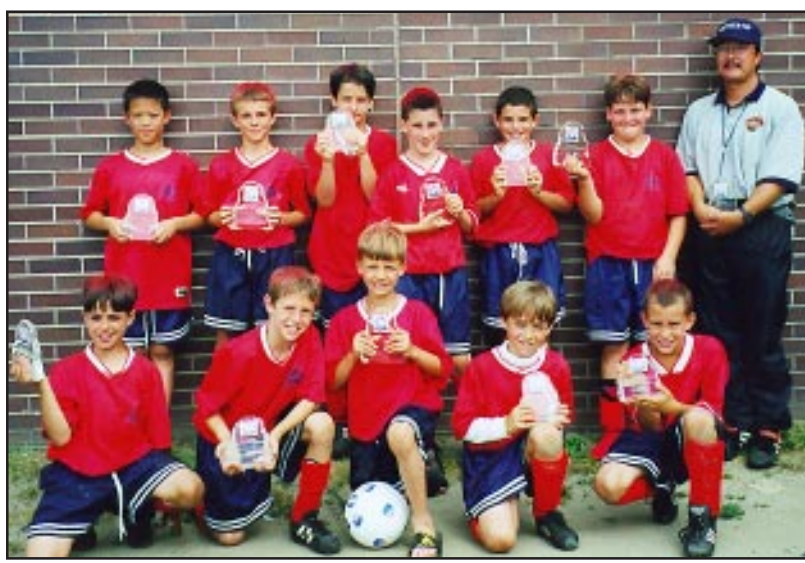
OCEAN TOURNAMENT CHAMPIONS...The Westfield U-10 Gunner soccer team easily won the Ocean Tournament held on June 12-13. The Gunners shot down five opponents en route to the title.