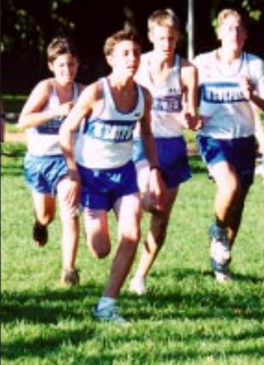
The Blue Devil XC Boys are off and running