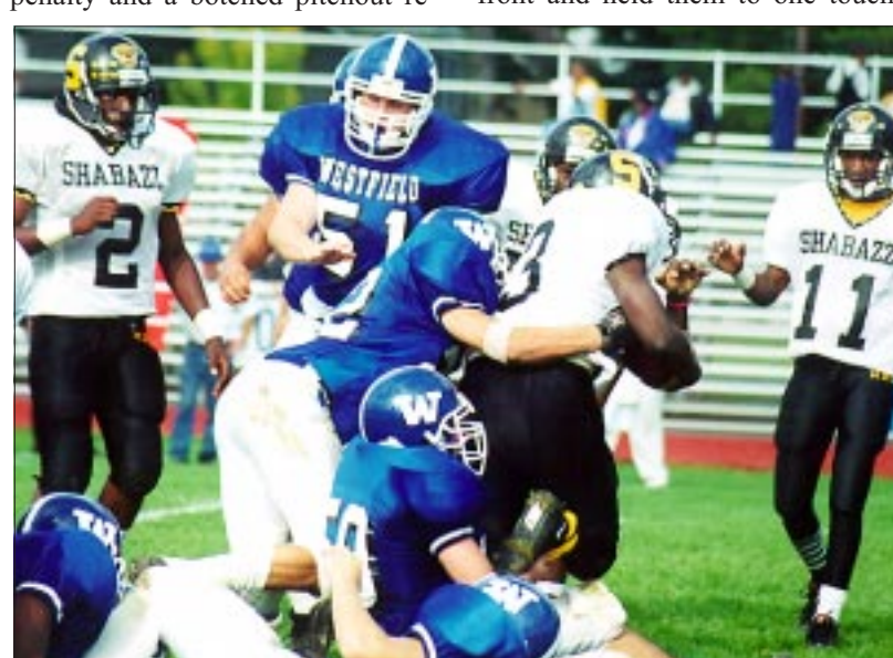
BULLDOGGING A BULLDOG... The Blue Devil defensive line crunches a Bulldog in the second half as they did throughout the game to win, 23-6.